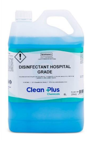
Code No 235